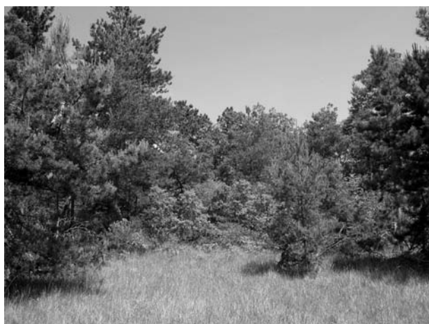
Figure 1 Habitat of C. montana in Arrancourt (France). Males were always heard perched in the trees at a minimum height of about 3–4 m.

To ensure species identification, calling songs were recorded using a Sennheiser ME64 cardioid microphone (frequency response: \pm 2.5 dB between 0.04 and 20 kHz) connected to a Marantz PMD 670 digital recorder (44.1 kHz sampling frequency, 16 bit precision). Signals were then analysed using Seewave (Sueur et al. 2006) a custom-made library of the R platform (R Development Core Team 2004).